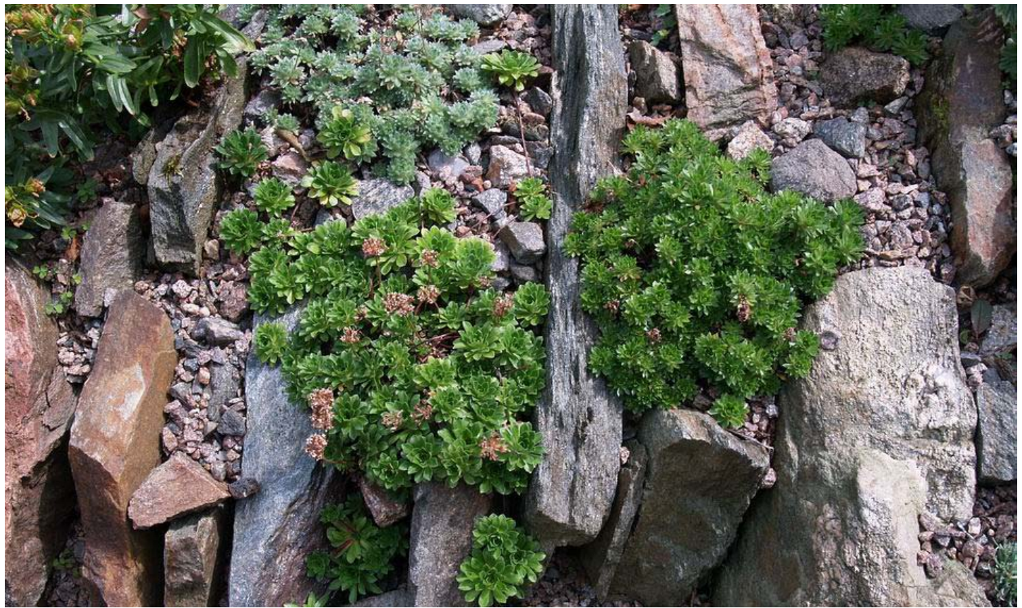
Androsace villosa jacquemontii A. sempervivoides A. sempervivoides x A. mucronifolia

Some of the Himalayan species are very obliging and send out runners which provide readymade cuttings.