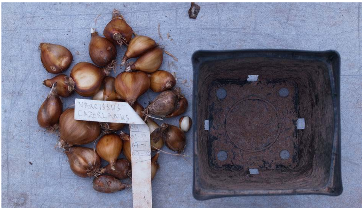
Narcissus cazorlanus bulbs

A similar decision of when to split or clean Narcissus bulbs has to be taken. My method is to gently rub the bulbs between my palms which both removes the loose skins and separates the bulbs that are ready to split. The separated offsets will generally grow on to flowering size quicker if removed from the competition of the parent.