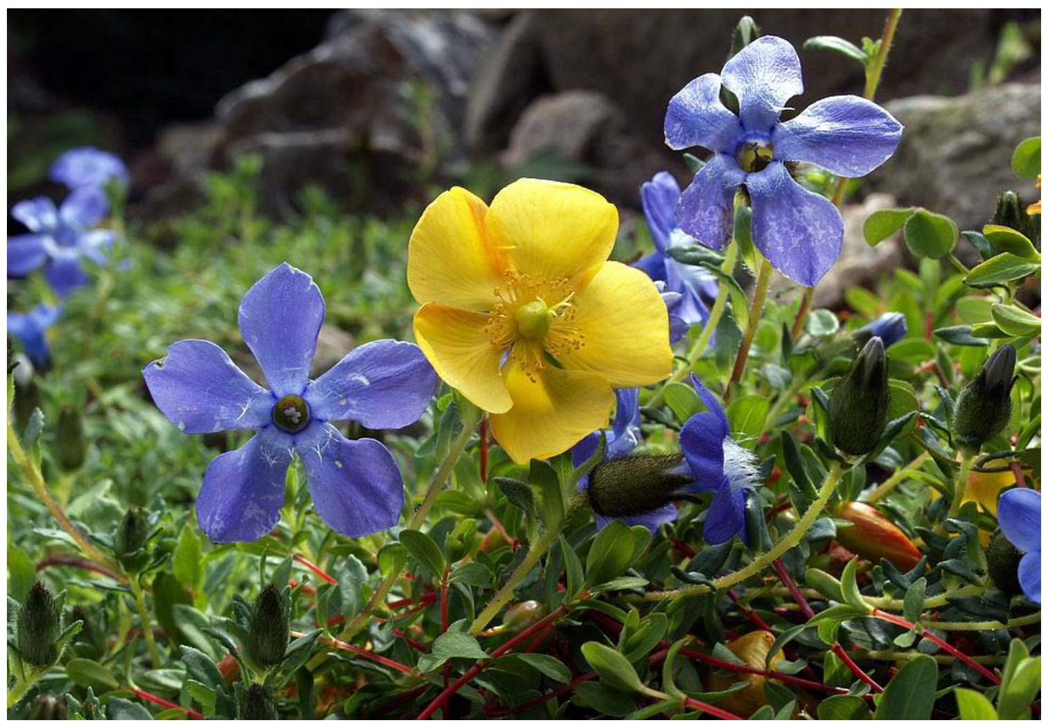
Cyananthus lobatus and Hypericum reptans

I will leave you this week with another view of the troughs and raised beds shows two Himalayan plants that enjoy spreading out and falling over the edges of the raised beds that are happy and attractive companions.