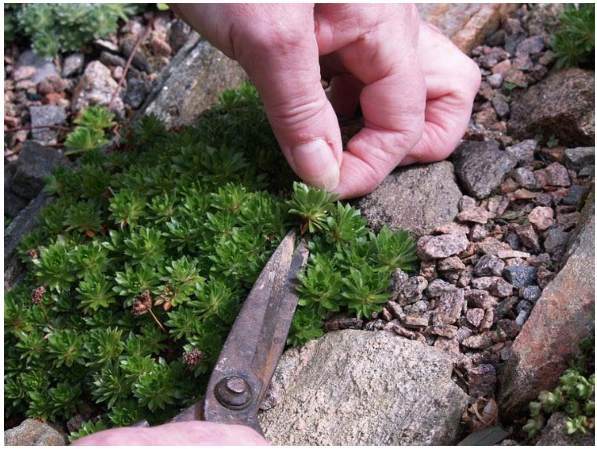
Androsace sempervivoides x A. mucronifolia

Some of the Himalayan species are very obliging and send out runners which provide readymade cuttings.