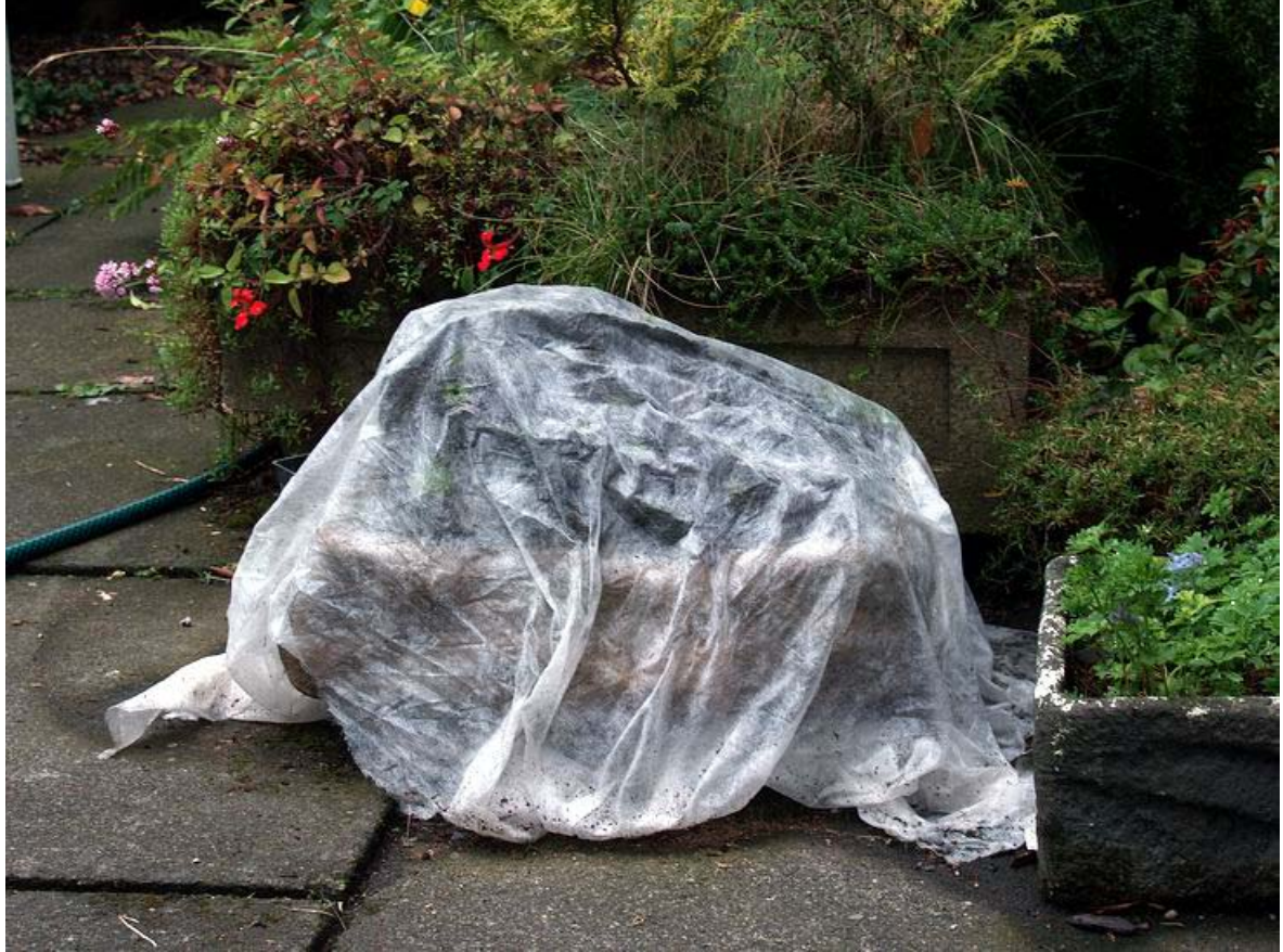
Trough with Androsace cuttings

I made this trough and landscaped it last year but it has sat without any plants until now because I wanted to plant it up with cuttings of the Androsaces I showed above. Now it is planted I hope that the cuttings will establish well.