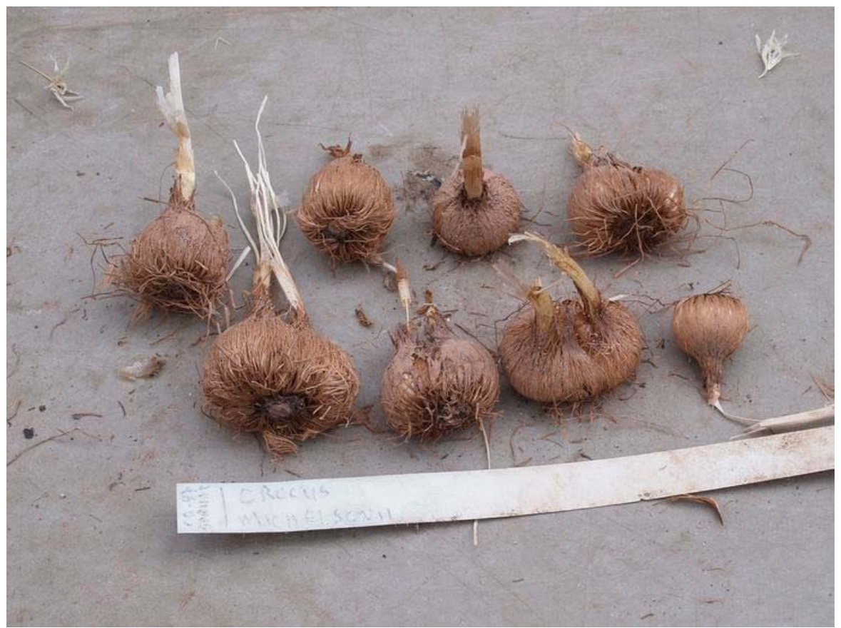
Crocus michelsonii corms

Back to the repotting of the bulbs or replenishing as I should perhaps call it as I am not replacing the compost. As I mentioned last week I am not tipping all the bulbs out unless I have a particular reason to check them either for health or curiosity. I wanted to see how the Crocus michelsonii corms were doing so here they are complete in their fibrous tunics.