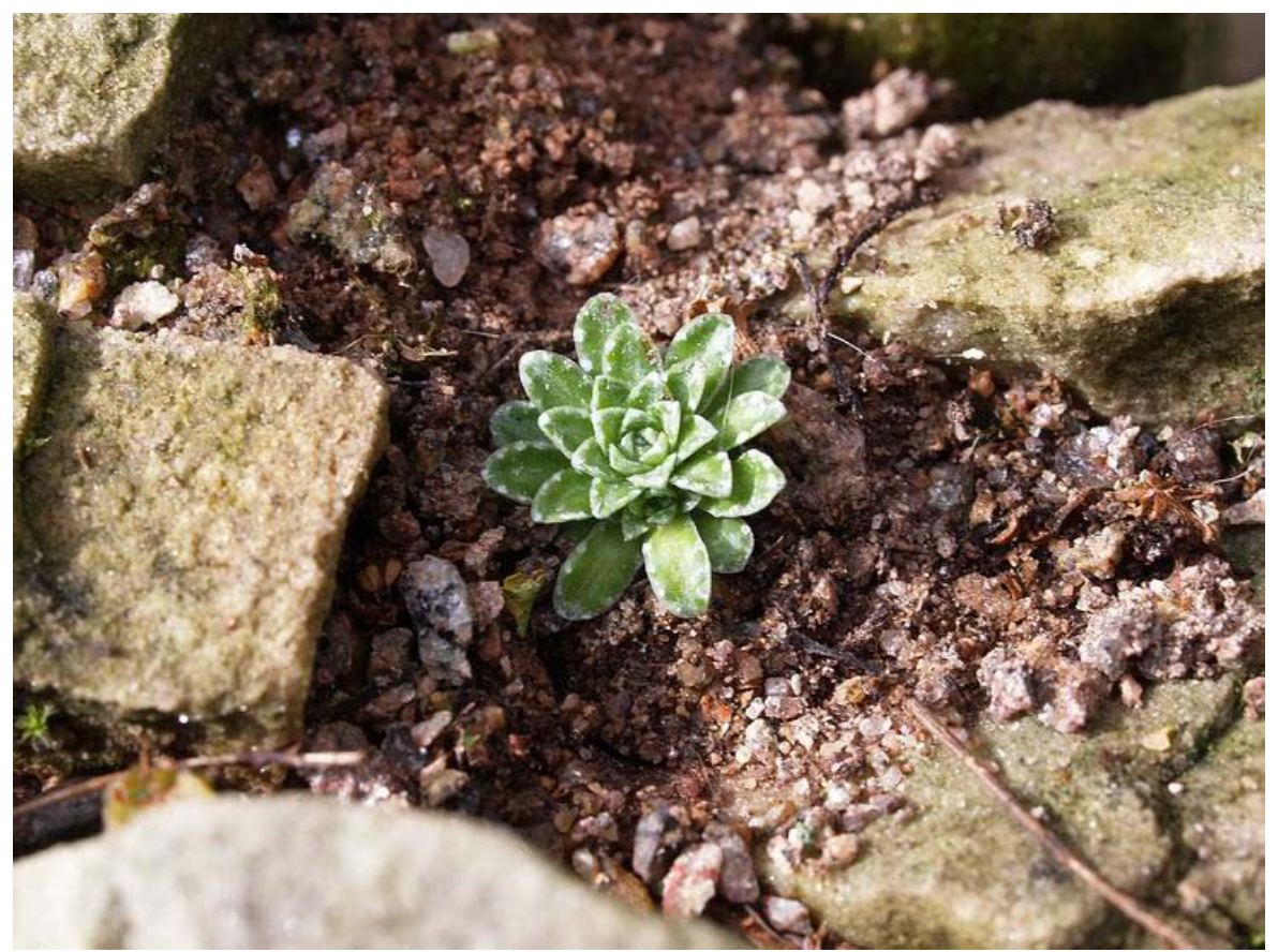
Planted saxifrage cutting

Provided it is kept shaded from long periods of direct sun and it is kept moist I find these cuttings will root quite quickly. I have some troughs that are now well established that I planted completely this way a number of years ago.